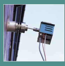
KM9108 Gas Conditioning Unit